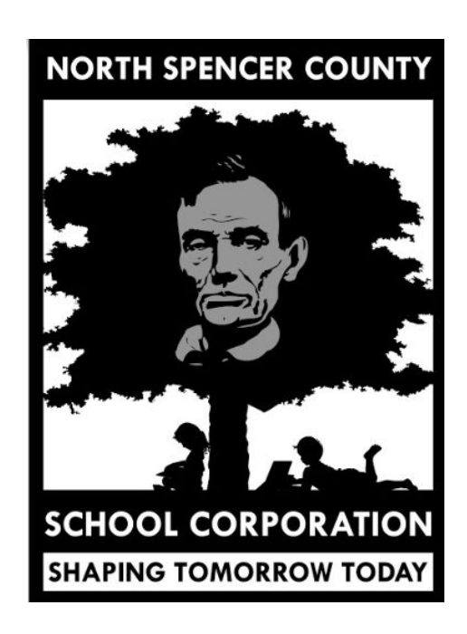
NSCSC Technology Vision Statement:

North Spencer Schools endeavor to prepare students for an ever-changing world that sees technological advancements happening at a rapid rate and is committed to preparing students for whatever path they choose after high school.